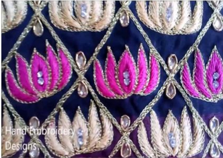
Fig (51) Flower Petals Rangoli