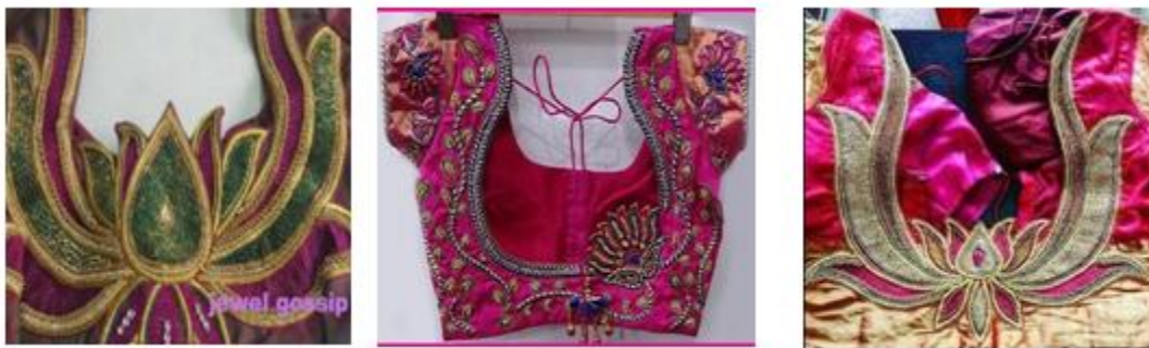
Fig (52) Flower Petals Rangoli Machine Lotus Embroidery Design on Sarees Blouse