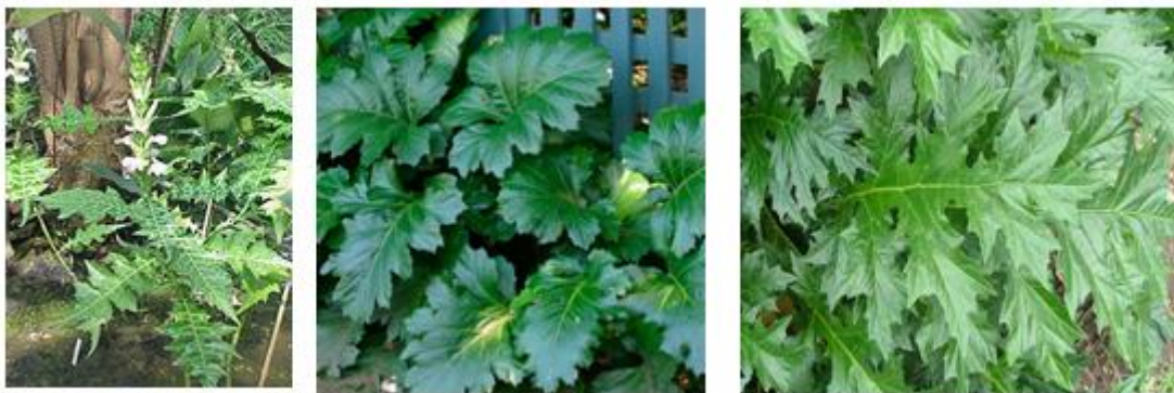
Fig (53)fig (54)fig (55), Acanthus mollis Acanthus montanus Acanthaceae Bear's Breech,

There are several species of acanthus plants found throughout the Mediterranean region. The two most common varieties found in early architecture are Acanthus spinosus and Acanthus mollis . Both varieties feature deeply cut leaves that lend a graphic and sculptural element to columns, borders, and corners. In fact, the prefix acanthus- means thorny, and the scientific name is drawn from ake, meaning a sharp point. Schwartz (2018)[16] has explained that A Roman writer named Vitruvius (75 BC to 15 BC) relates a story about the origin of acanthus leaves as a pattern, stating that the Greek architect and sculptor Callimachus had been moved by the sight of a basket that was left on the grave of a young girl. Fig (53, 54,55) is showing different types of acanthus plant.